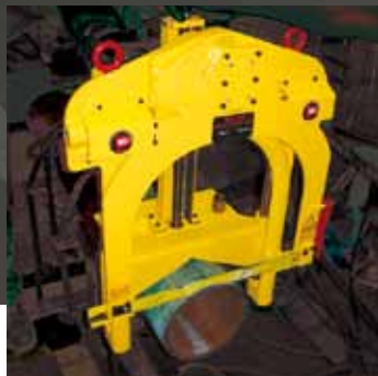
Quick cold cuts, minimal clearance.