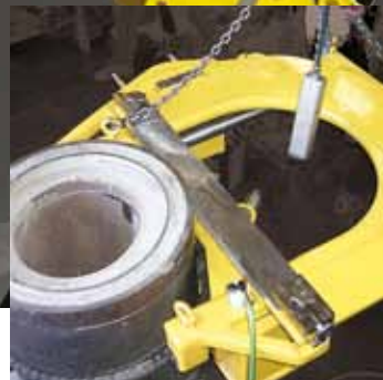
Portable, rugged design.