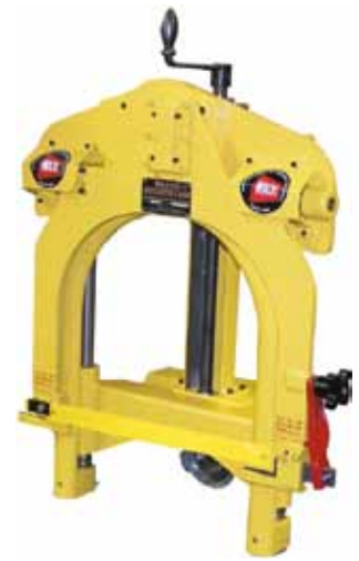
E.H. WACHS Guillotine

The high-speed steel blades are easily changed. The unique Guillotine cutting action lifts the blade from the cut on the return stroke, extending blade life.