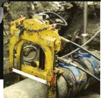
Long blade life.