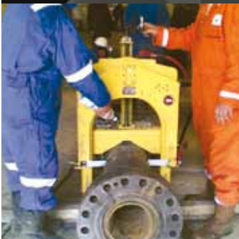
Easy setup, vertical or horizontal.

Fast setup and cutting, both horizontally or vertically.