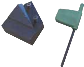
Bevel tool insert holder kit 37.5°