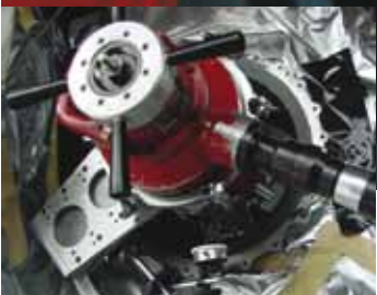
SDB pipe end preparation or FF flange preparation

Fast, easy setup – self centering design.