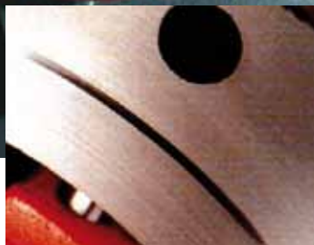
FF 3-jaw independent "short perch" mandrel or SDB mandrel principle