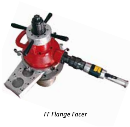
FF Flange Facer

Model FF 424: Flange facing machine for facing flat, raised or recessed face flanges from ID 101.6 mm (4") through OD 609.6 mm (24") up to a DN400 (16") 150# flange.