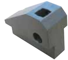
Single point beveling tool holder