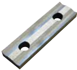
Premium grade HSS insert (2 sided)