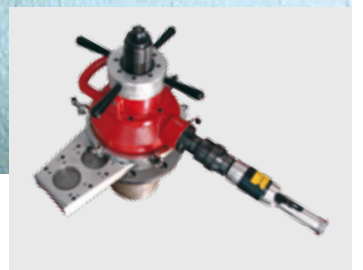
FF flange preparation up to OD 610 mm