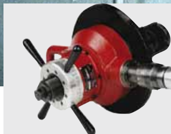
SDB-pipe end preparation form tooling up to OD 323 mm