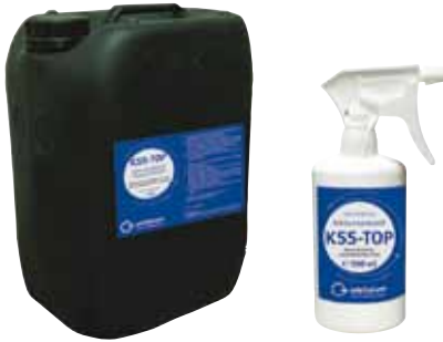
Cutting lubrication KSS-TOP

The water soluble, fully synthetic cooling fluid extends the tool life of the tool bits. Contains no hazardous substances (no labeling requirements according to GefStoffV1) and is well corrosion resistant. Developed conforming to drinking water requirements according to DVGW work sheet W521 (thread cutting compounds for drinking water installations) and basically complies with these specifications. Is biologically degradable (OECD 302 B).