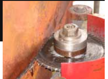
All pipe diameter including tanks.

Portable Milling Machines Trav-L-Cutter 27