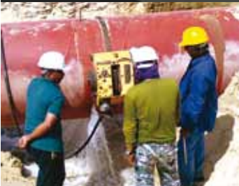
Horizontal and vertical cutting.

Safe cold cutting, compact design, easy set-up.