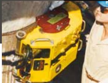
Fast and accurate.