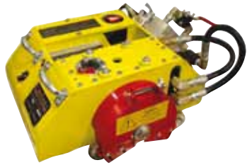
Model HE Hydraulic