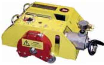
Model E Pneumatic