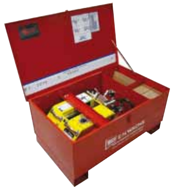
Steel storage case